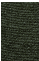
TELLARO 40 - EXTRA

With the Dao Soft sofa, designer Gordon Guillaumier proposes a modular system that focuses on planning freedom and the geometric harmony of soft, calibrated volumes. Designed to create environments devoted to well-being and calm, the Dao Soft sofa stands out for its ability to adapt to formal or informal settings, thanks to balanced proportions and a discreet but recognizable aesthetic. High backrests and seats with differentiated polyurethane padding and Cloud Foam and Microflock inserts ensure great comfort, meeting the needs of the project in both residential and contract settings. Available in two variants - Dao Soft Base, with an upholstered base, and Dao Soft Light, with black feet - the collection is completed with a strong sartorial connotation, expressed in the sewing "a pizzicotto" that features the cover either in fabric or leather with a precise, textural hallmark. In the proposed versions, the Dao Soft sofa is explored through different spatial solutions, to offer concrete tools in defining welcoming, flexible environments consistent with a measured and contemporary design language.