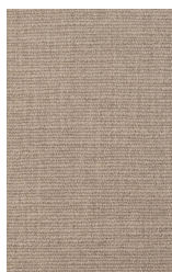
TELLARO 10 - EXTRA