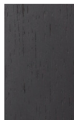
Frassino Color Wenge