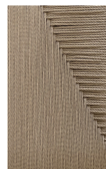
Corda di Carta color Naturale